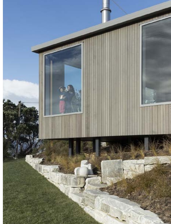
Left The cedar cladding is taking on a shade of driftwood. O’Connell and her daughter check out the view. On the block wall below is ‘Yuvaika’, a marble sculpture by Dryden.

“The house isn’t about exposing or celebrating structure but more about a sculptural textured form.”